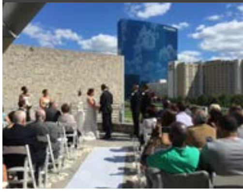
WEST CANAL TERRACE