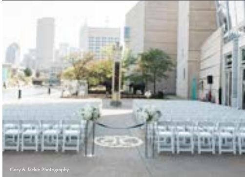
BALL FAMILY TERRACE