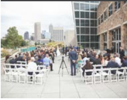
FARMERS MARKET CAFÉ TERRACE